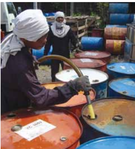
Personnel from Genetron securely unloads PCB-free used oil from VECO's transformers and loads it into a drum container for proper storage and handling.

Genetron, a DENR-accredited company started used oil treatment and recycling in 2000. The company promotes sound environmental practices and advocacies in the treatment of hazardous wastes. Genetron treats and re-refines the oil to a product which can be re-incorporated into the economy.