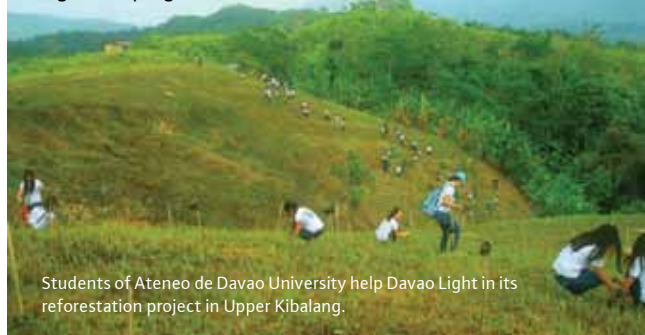
Students of Ateneo de Davao University help Davao Light in its reforestation project in Upper Kibalang.

They were assisted by members of the local community, specifically the Upper Kibalang Agfo-froestry Farmers Association (UKAFA), the people's organization appointed by the Department of Environment and Natural Resources to be the steward of the community-based forest management program in the area.