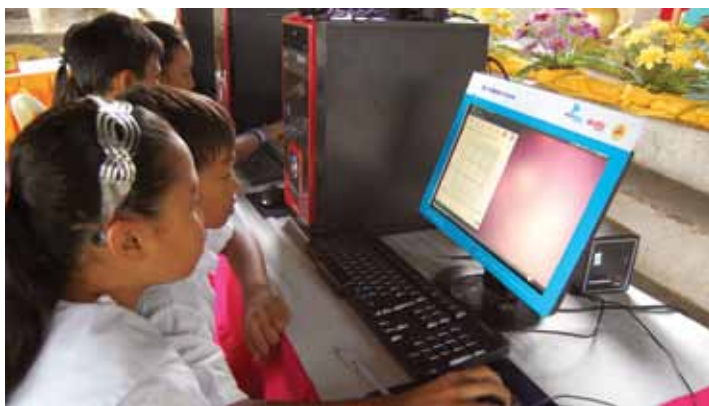
Students of South Cotabato face a better future now that they have computers to aid them with their school work.

AboitizPower, in partnership with Aboitiz Foundation, recently inked deals with power distributors South Cotabato I Electric Cooperative, Inc. (SOCOTECO I), South Cotabato II Electric Cooperative, Inc. (SOCOTECO II), and major industrial steel manufacturer Steel Asia to help improve the quality of education for the youth.