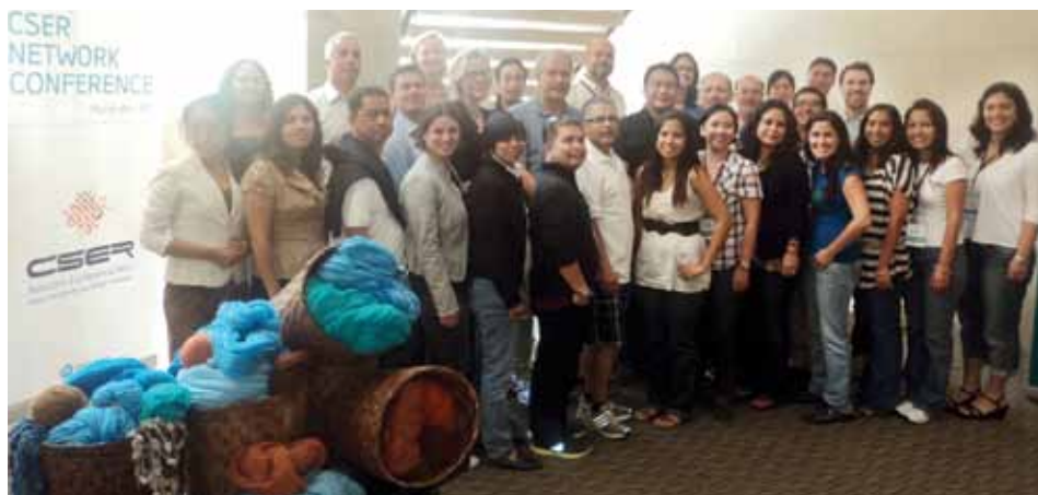
CSER delegates from SN Power's main and international offices and projects in Norway, Brazil, Chile, Nepal, the Philippines and host country Peru with joint venture, Philippines-based SN Aboitiz Power.

SN Power Philippines Country Representative