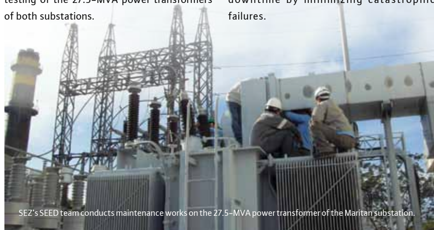
SEZ's SEED team conducts maintenance works on the 27.5-MVA power transformer of the Maritan substation.

The activity aimed to detect and correct potential hazards that can cause failure of existing equipment and facilities. Properly maintained electrical equipment reduces downtime by minimizing catastrophic failures.