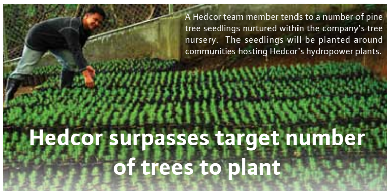
A Hedcor team member tends to a number of pine tree seedlings nurtured within the company's tree nursery. The seedlings will be planted around communities hosting Hedcor's hydropower plants.