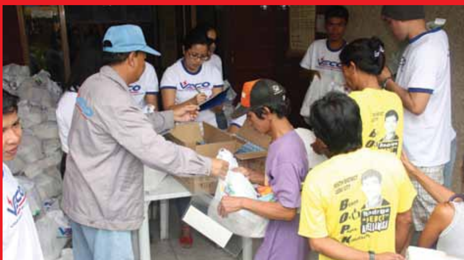
OPERATION TABANG. The Visayan Electric Co. (VECO) distributed 424 packs of relief goods last March 17 to fire victims of Barangay Suba, Cebu City. Items given to the affected residents were 3 kilos of rice, canned goods, noodles and CFL bulbs. VECO's customer service representatives were also on hand to assist fire victims in their application for new electrical connections.

Xavier University donated a five-hectare land for this project. About 550 houses will be constructed on this property, under the management and supervision of Xavier University in partnership with the City Government. National government agencies will also be, particularly for site development and promotion of livelihood opportunities for the community.