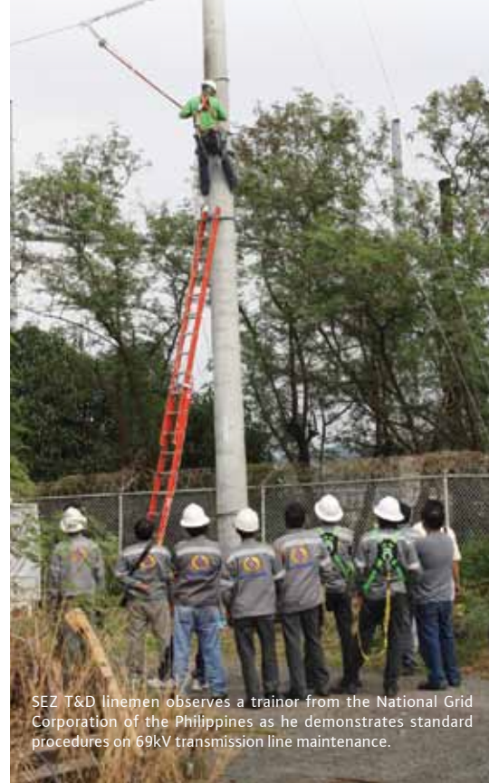
SEZ T&D linemen observe a trainor from the National Grid Corporation of the Philippines as he demonstrates standard procedures on 69kV transmission line maintenance.