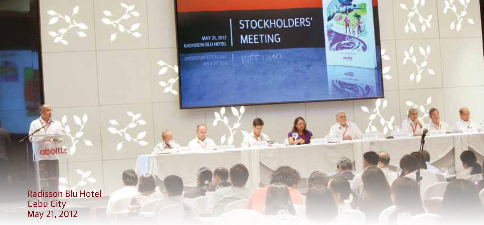
Radisson Blu Hotel Cebu City May 21, 2012