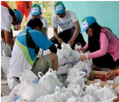
Pilmico volunteers help repack the relief goods that were distributed to victims of the earthquake that hit Negros Oriental. Aside from Pilmico, CitySavings also helped in the distribution, in coordination with Aboitiz Foundation.

Barely days after the Feb. 6 earthquake that affected parts of Negros Oriental, team members from City Savings Bank (CitySavings) and Pilmico Foods Corporation braved aftershocks and impassable roads to help individuals affected by the calamity.