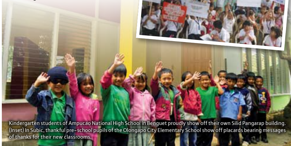
Kindergarten students of Ampucao National High School in Benguet proudly show off their own Silid Pangarap building. (Inset) In Subic, thankful pre-school pupils of the Olongapo City Elementary School show off placards bearing messages of thanks for their new classrooms.

Meanwhile, Davao Light & Power Company, Inc. has turned over a two-classroom to New Katipunan Elementary School. The distribution utility will build two more Silid Pangarap buildings within its franchise area.