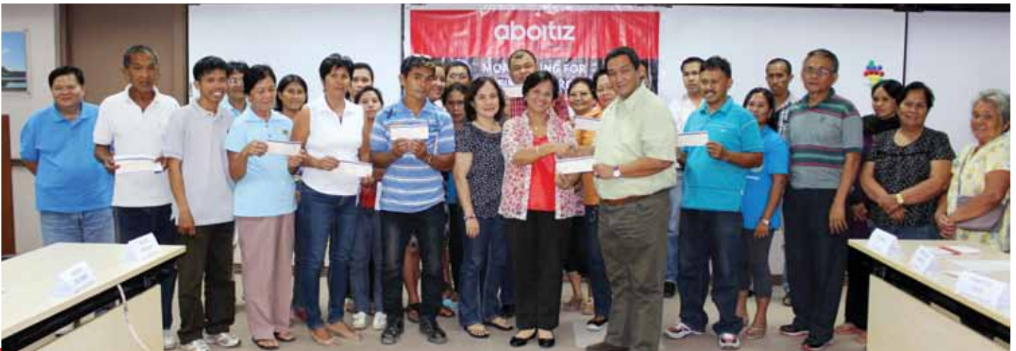
P10.8M IN AID. Fifteen Cebu-based partner-organizations of the Aboitiz Foundation now have additional funds to support various livelihood projects like swine fattening, consumers' store and farm productivity after they were recently given P10.8 million in financial assistance.