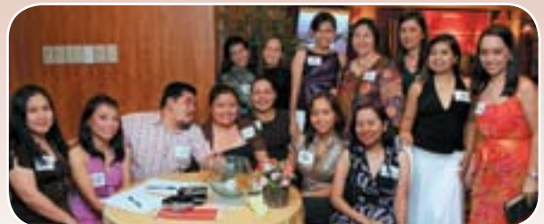
The Aco-Lex Team shown all glammed up, strike a pose for the camera before the start of the party.