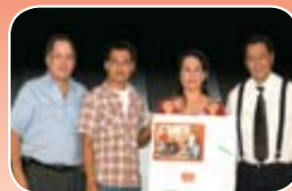
Aboitiz Group Foundation