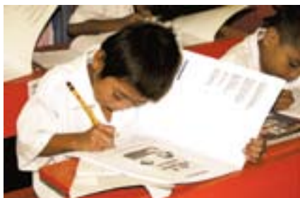
A child writes his name on his own AAF Student's Workbook.

The storybook, which includes 16 values, was also made into a song and launched during the congress.