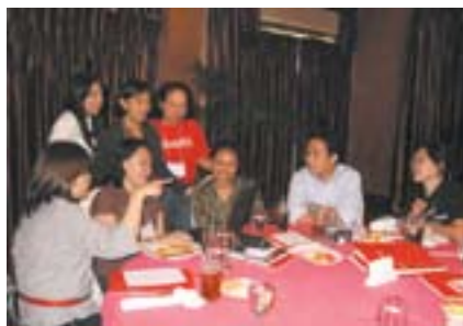
Aboitizland Brand Task Team members confer with ACO colleagues