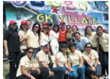
The smiling AboitizLand team after the turnover

AboitizLand, Inc. recently turned over an P8-million off-site drainage system it has installed for the Sugbu Gawad Kalinga Village in Tunghaan, Minglanilla. The drainage network, which will keep the area protected against flooding and erosion, is AboitizLand's "contribution to Cebu's vision for a more humane and empowered citizenry".