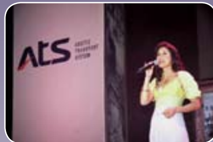
Entertainment personality Agot Isidro serenades the audience with "Unforgettable"