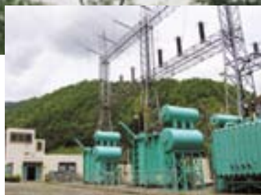
The Binga plant in Itogon, Benguet

The Power Sector Assets and Liabilities Management Corporation (PSALM) on December 19, 2007 issued the Notice of Award to SN Aboitiz Power Hydro, Inc. (SNAP Hydro), a consortium between Aboitiz Power Corporation and SN Power AS of Norway, officially declaring SNAP Hydro as the winning bidder for the Ambuklao-Binga Hydroelectric Power Plant Complex. SNAP Hydro submitted the bid on November 28.