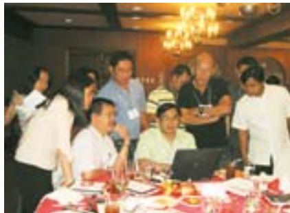
The Power Group Brand Task Team

After the forum, the brand task teams are now expected to come up with their respective brand roadmap and brand plan to be submitted to the Brand Management Team for consultative alignment and review. They are also encouraged to come up with brand maintenance activities to sustain the learnings from the forum as well as to have a quarterly brand task team meeting to monitor progress on the brand roadmap.