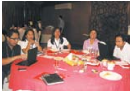
The Metaphil and CSB Teams