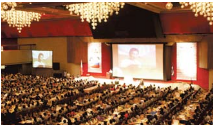
The PICC Reception Hall is filled with participants of the UnionBank Teachers' Congress

UnionBank recently conducted the National Capital Region (NCR) Department of Education (DepEd) Teachers' Congress at the Reception Hall of the Philippine International Convention Center. The event introduced the As a Filipino (AAF) Learning System to the biggest gathering of Grade 2 public school teachers, principals, superintendents and their assistants, and supervisors.