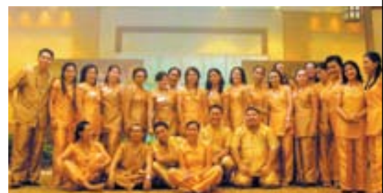
The AboitizLand team clad in yukata - and kimono - inspired costumes

The Kishanta Zen Residences formal launch was a resounding success as proven by the deluge of reservations made during and after the launch.