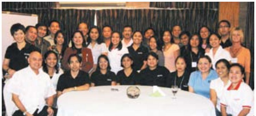
The 1st Aboitiz Brand Forum participants