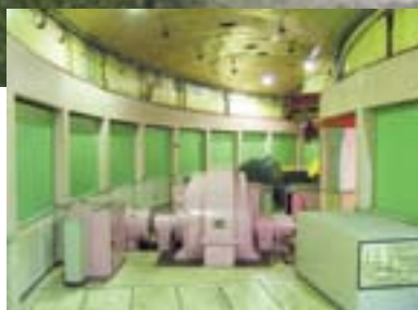
The Ambuklao plant in Bokod, Benguet