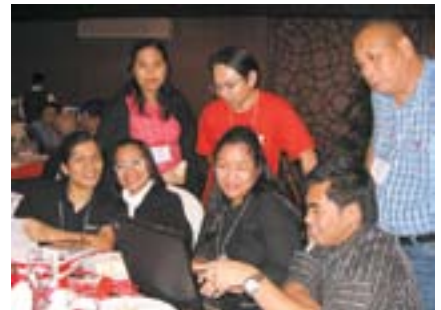
The Food Group, ACO/AEV and AGFI Teams