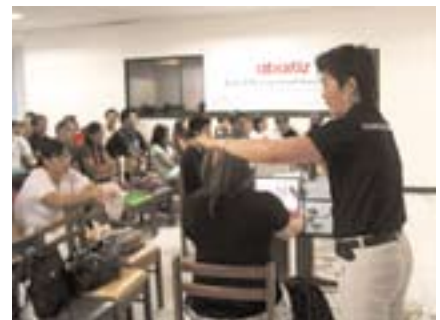
ABMP in Ateneo de Davao

The AEV Brand Management Team continues to conduct the Aboitiz Brand Marketing Program (ABMP) nationwide as an external marketing tool for the Aboitiz Group. The program's main objective is to increase awareness of the Aboitiz brand in schools, among business groups and socio-civic organizations who are interested to learn more about the Aboitiz story.