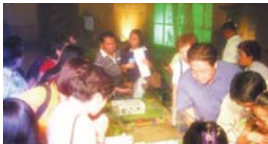
The vecinos looking at the Kishanta Zen Residences scale models

Black ninjas, the fluid grace of bellydancers, Japanese paper lanterns, and Japanese pica-pica served with cocktails -- all these were designed to transport guests into the realm of the simple and serene.