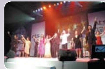
Performers belt out "Do I Make You Proud", the finale song.