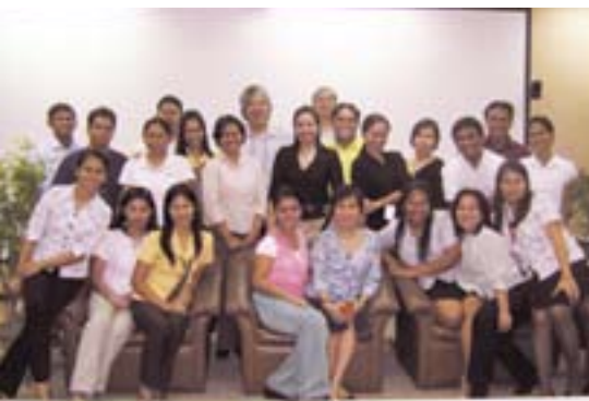
Caption: ATMC and ATS TMC members with guests

The Aboitiz Toastmasters Club and the ATS Toastmasters Club held a joint meeting with the theme "Corporate Social Responsibility: The Aboitiz Way" at the ACO-AVR last October 11, 2007.