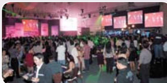
Giant video screens surround the packed party venue.