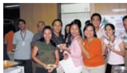
Smiling team members strike a pose during the anniversary celebration.