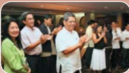
A round of applause for the efforts of Acolex and the achievements of its external counsels.