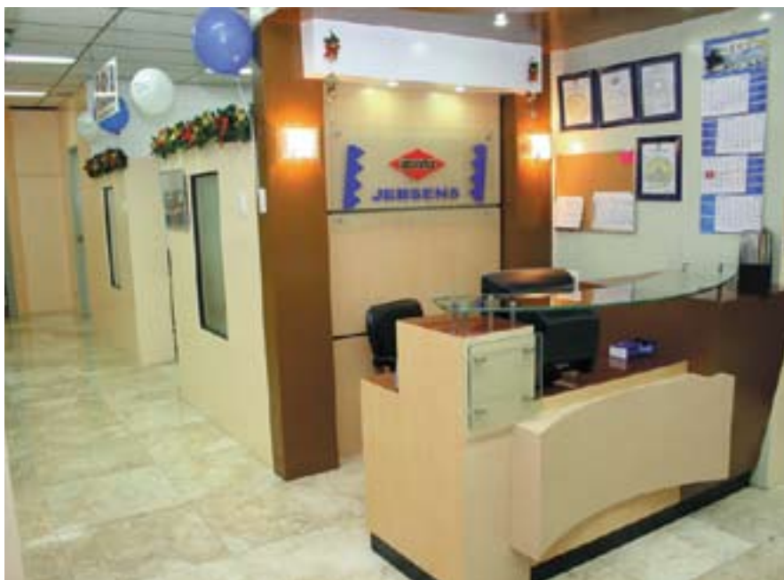
The reception area of the new office