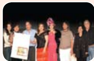
Branding & Corporate Communications