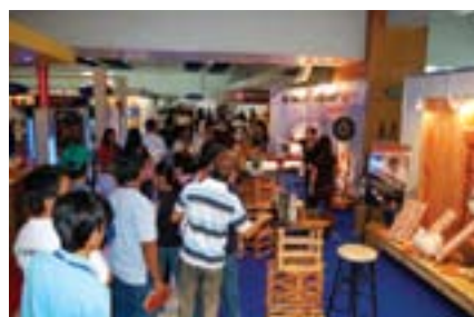
Visitors patiently wait for their turn to play and hit the dart target and win Poultry Solutions freebies.

The FFI booth was designed with a combination of creativity and formality to deliver a clear message to everyone and to inform them how FFI differs from the others. The backdrop message, "Is the (performance) peak really unattainable? Think again!"