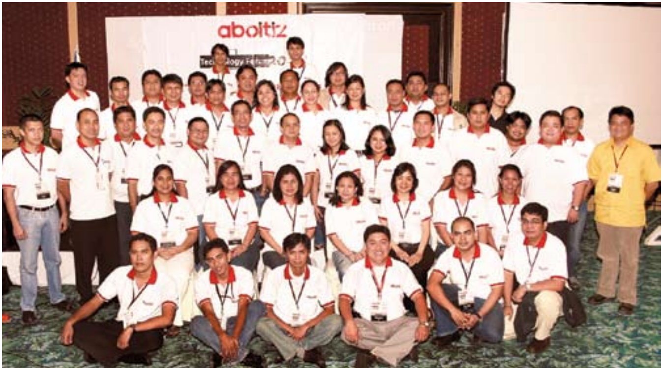
Delegates to the 1st Aboitiz Technology Forum from the Corporate Headquarters, Aboitizland, Pilimico, ATS, 2GO, Hedcor and City Savings Bank