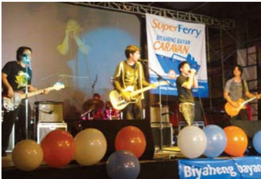
The SuperFerry Biyaheng Bayan Caravan Concert featured local talents, Tuesday Vargas, Sugarfree and 6 Cycle Mind bands.

SuperFerry has re-opened three ports in time to service the expected rise in summer travel activity, including an alternative gateway to Boracay.