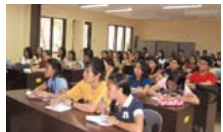
The 1st ABMP in UP Cebu

Since its launch in February 2007, the Brand Management team has already conducted 21 ABMP sessions in schools such as UP Cebu, Ateneo De Davao, UP Baguio, MSU IIT in Iligan, Xavier University in Cagayan, Notre Dame University in Cotabato, Lyceum University in Subic and for socio-civic organizations Rotary Club of Cotabato and Tarlac Convention Visitors Bureau.