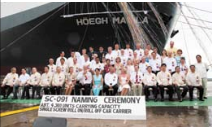
Aboitiz executives, THICI and Hoegh Autoliners officials join President Gloria Arroyo pose in front of the newly-christened PCTC.