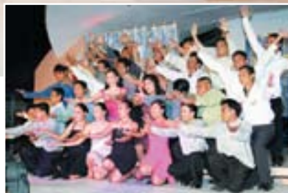
The FBMA 27k performs the night's opening number.

November 23, 2007 was a memorable day for the FBMA family as it celebrated its Recognition Night and Service Awards in a meaningful and touching tribute to this year's batch of 27 honorees. The spacious Exasperanza Binghay Sports Complex was transformed into a grand hall truly fitting for the honorees, team members and guests who attended the affair.