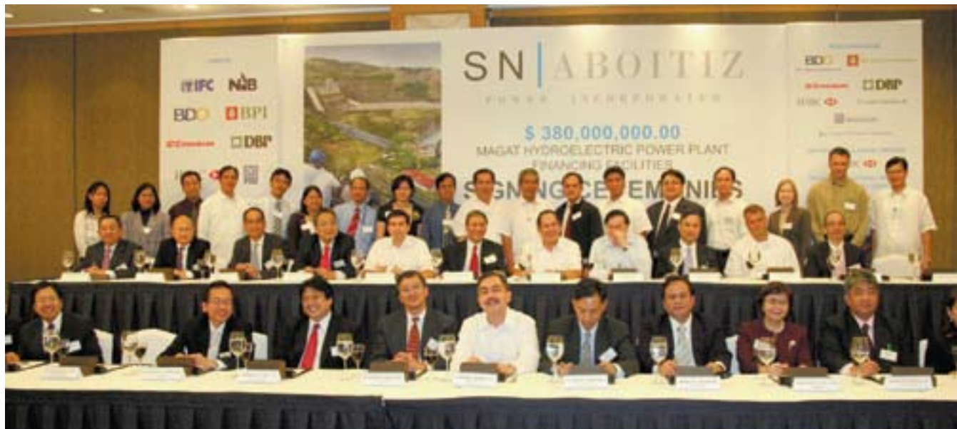
On October 26, 2007, a loan-signing ceremony was held at the Makati Shangri-la Hotel to finalize the US$380-million loan secured by SN Aboitiz Power, Inc. from a club of banks led by the International Finance Corp., the private investment arm of the World Bank Group.