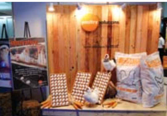
This winning FFI booth says it all. "Performance peak is never impossible with Poultry Solutions."

Which came first? The chicken or the egg? Young minds, especially children, often ask these questions. Amid this argument, a simple thing about these two remains evident. Chicken and eggs are still the cheapest protein sources.